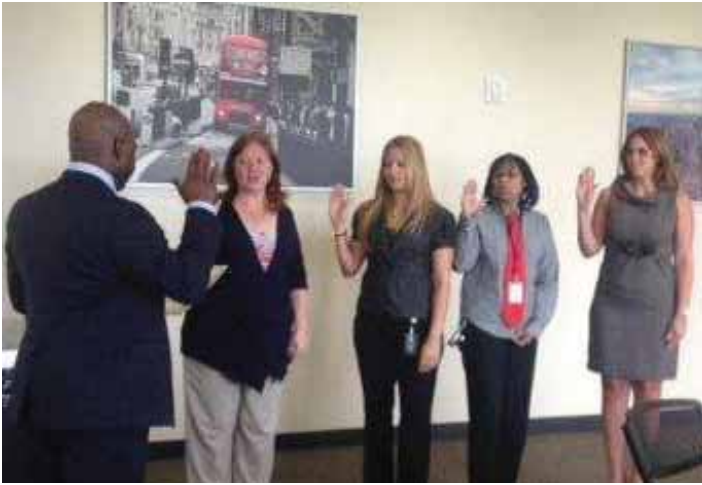
Miami -Dade County Officers