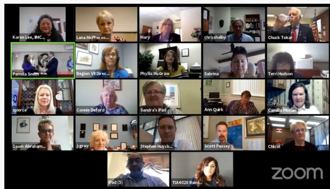
2020-2021 Incoming Board of Directors Meeting: Swearing In