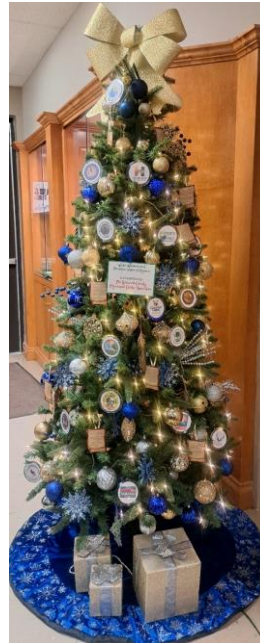
Pictured above: The Broward County Municipal Clerks Association (BCMCA) holiday tree at the Plantation Historical Museum in Plantation, Florida.